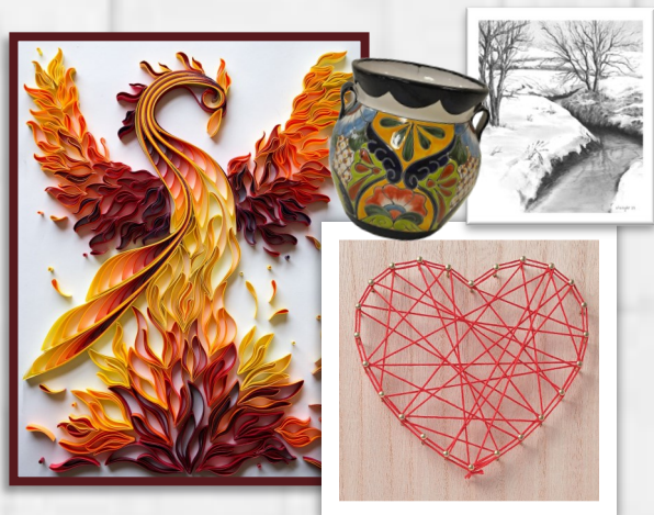
artwork shown for example only